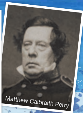
Matthew Calbraith Perry