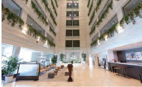
Bayside Hotel Azur Takeshiba

Takeshiba was established in 1927 when the sea east of the former Shibarikyu Gardens was reclaimed. Today, it is one of the most rapidly changing areas in Tokyo. The Grassroots Summit Ceremony and Convention will be held at the Bayside Hotel Azur Takeshiba, adjacent to Takeshiba Pier, which has long served as one of the gateways to the Port of Tokyo, to celebrate our friendship between the U.S. and Japan, and to consider globalism and world peace.