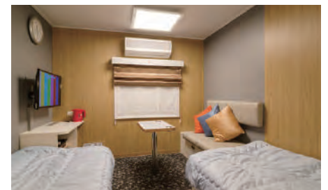
Standard room with double occupancy

*As of July 2022, Ogasawara Kaiun and Ogasawara Village, in cooperation with the Tokyo Metropolitan Government and others, are conducting PCR testing (free of charge) prior to boarding the Ogasawara Maru as one of the border control measures against new coronavirus infection.