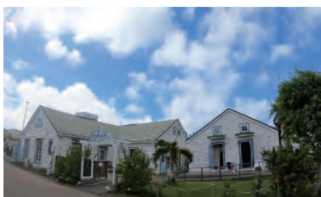
PAPA's Island Resorts

*Due to the limit of the room availability, requests cannot be guaranteed.