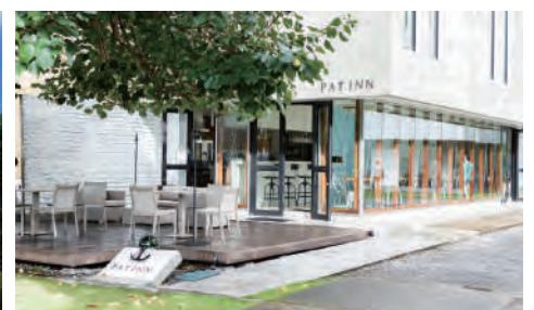
Hotel Pat Inn