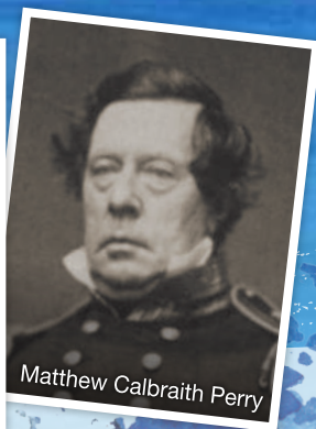
Matthew Calbraith Perry