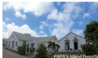
PAPA's Island Resorts

*Due to the limit of the room availability, requests cannot be guaranteed.